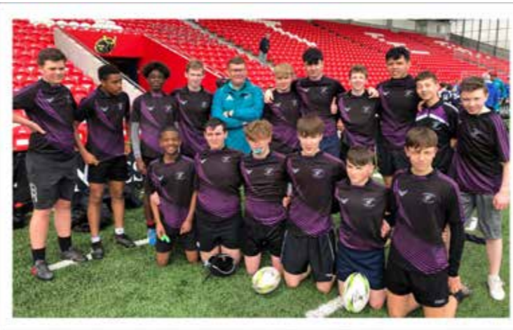
CCC Rugby Team