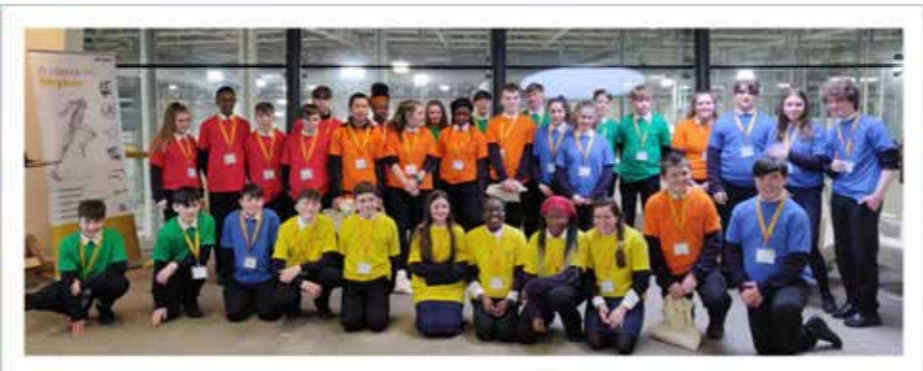
2nd Year students on their recent visit to Stryker to celebrate Engineers Week 2019.

The day concluded with a design challenge. Students worked in teams to design and build bridges using spaghetti and marshmallows.