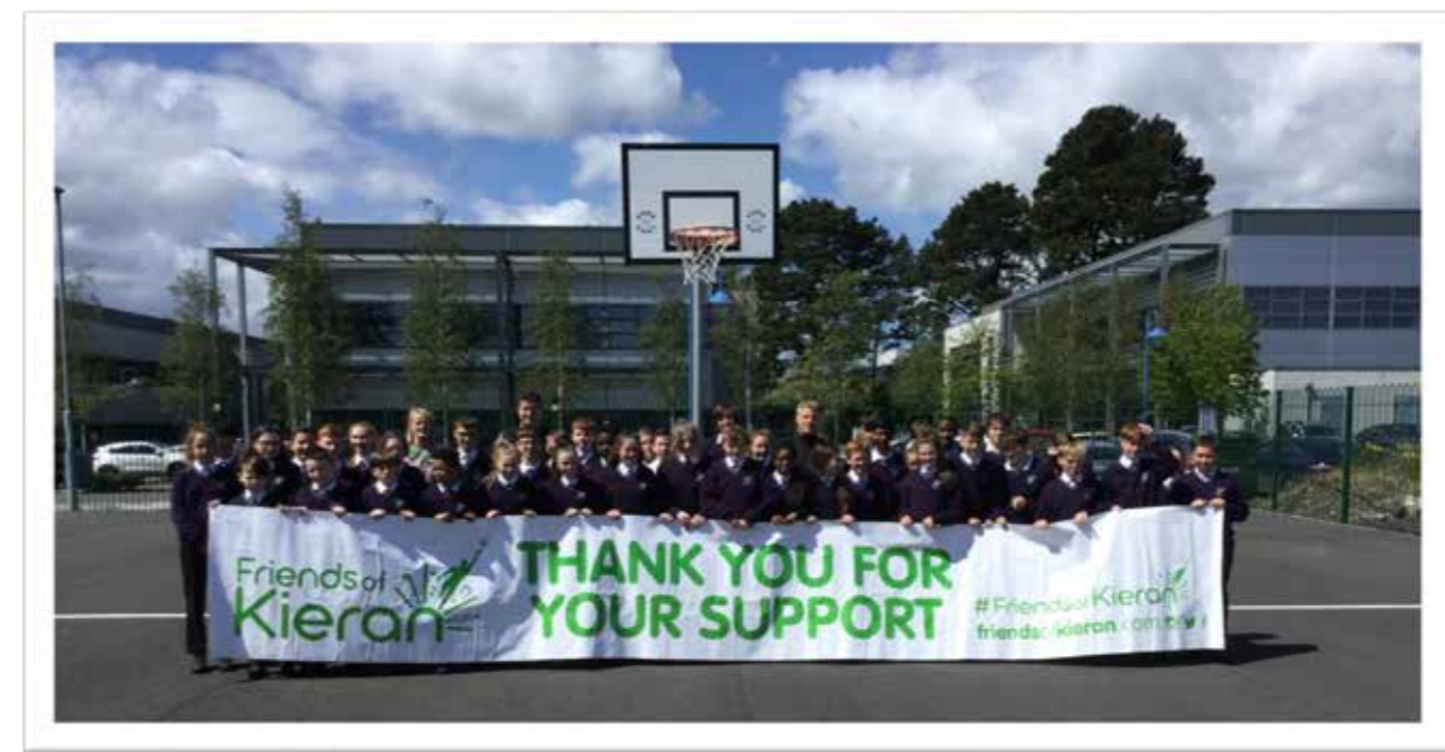
Presentation of cheque to Friends of Kieran committee by CCC Students