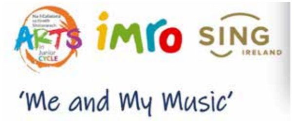
1st year Music class partaking in JCT 'Me and My Music' Initiative