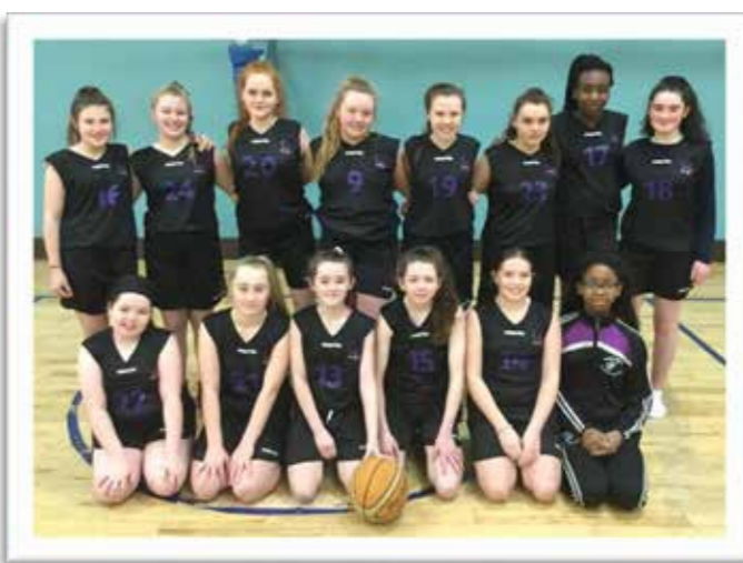
CCC Girls Basketball Team