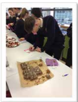
Students awarding marks for each dish

The students chose their favourite dishes using a specially designed scorecard and the results were tallied.