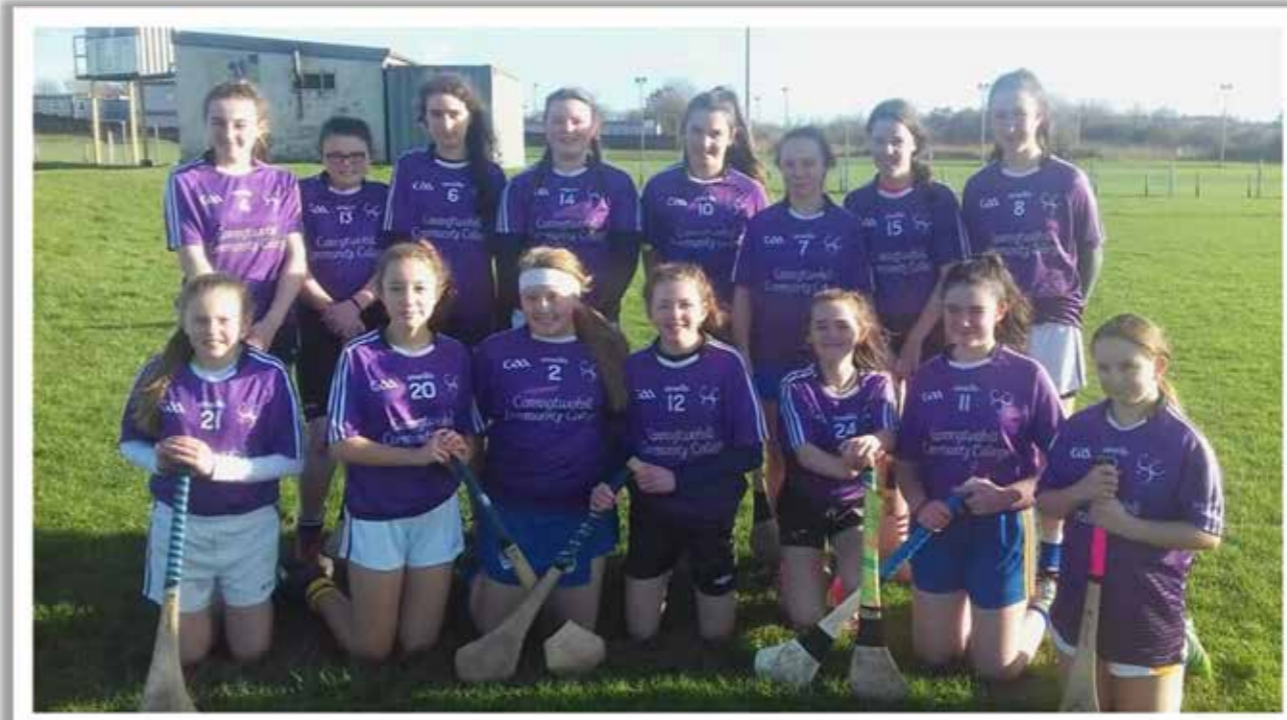
CCC's First Camogie Team to compete in the Camogie Championship

"Practice like you have never won. Perform like you've never lost"