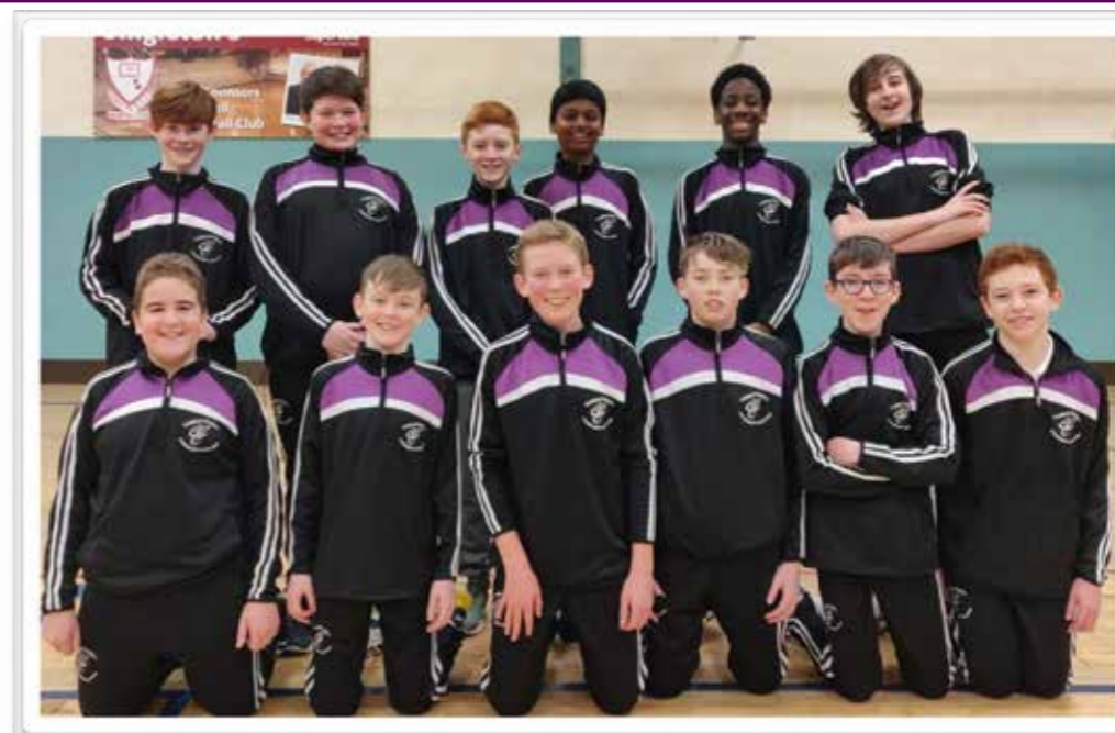
First Year Boys Basketball Team 2019

Even though they were disappointed, the lads agreed that they had improved enormously in the short time span. We are determined that with a lot of practice