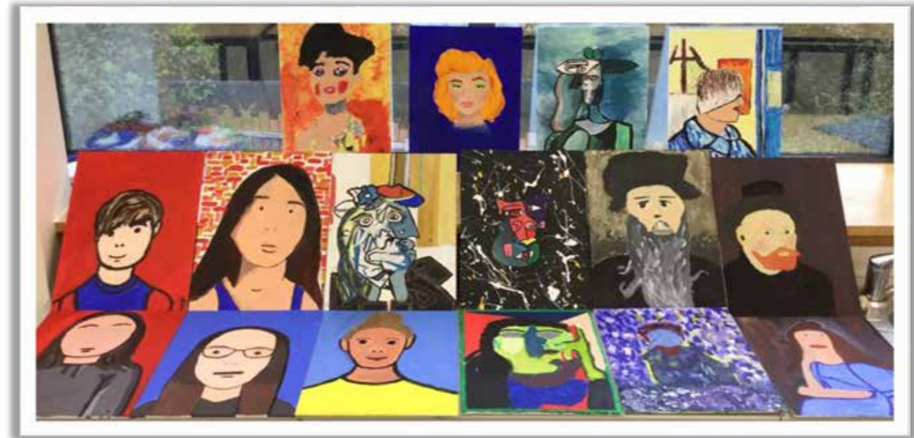
1st year portraits nearly finished for the annual exhibition