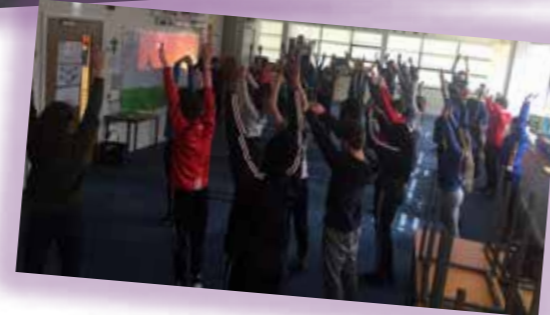
Wellbeing Afternoon Activities—including Physical Activity, Music and Tai Chi/Positive Mental Health