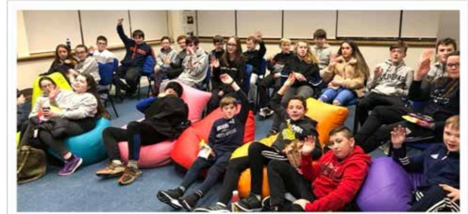
Movie Night in CCC