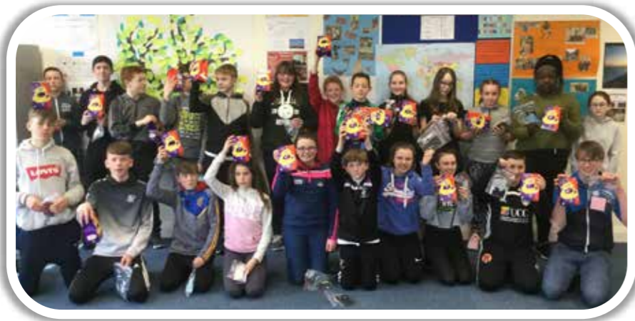
Digital Detox participants after completing their challenge of staying phone-free throughout lent