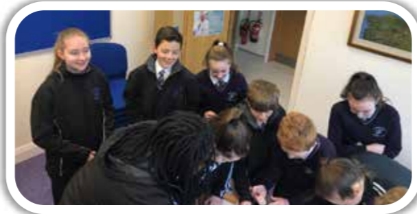
Students packing away their phones

The benefits of this was task were plentiful: more personal time, better sleep, less stress, more family time, going outside more, doing more sports and more fresh air. We did this to raise money for the charity, Trócaire, but also to prove a point that we