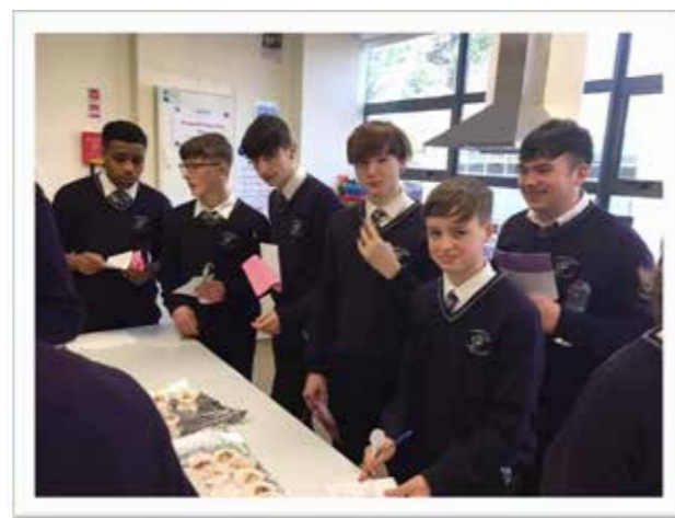
3rd Year students tasting the treats baked in the Staff Bake Off