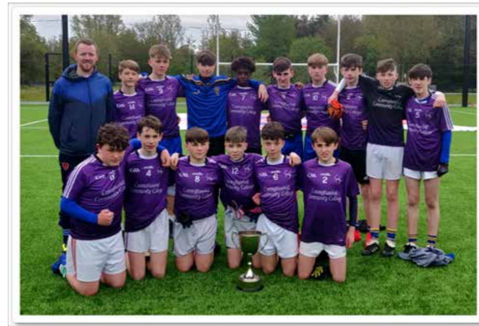
U14½ County Championship Cup Winners