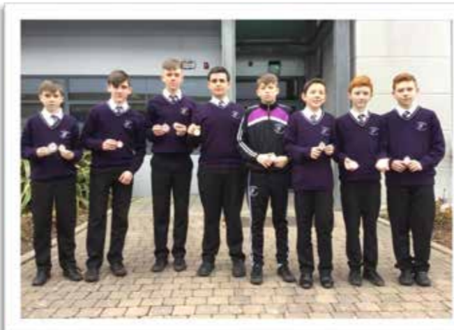
Orienteering Teams displaying their recent successes

On the 12 th February 2019, our 1 st and 2 nd year students participated in the Cork Post-Primary Orienteering Championships in Fota Gardens. The