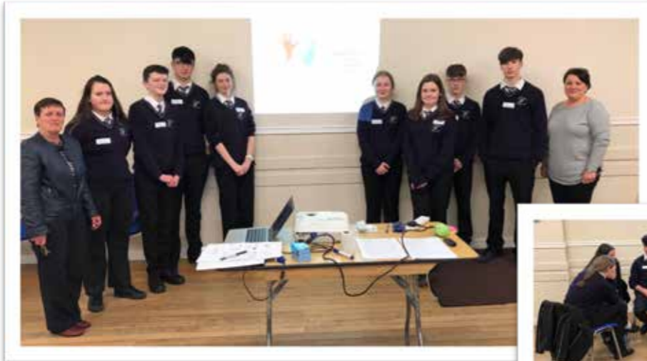
Student Council members from Carrigtwohill Community College and St. Aloysius' College working collaboratively