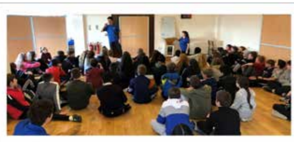
The Net Ministries Team at the Glounthaune Parish Centre during the First Year Retreat

Our students' annual retreats took place this year in February. 3 rd years visited SCALA at Blackrock for their retreat this year, while both 1 st and 2 nd years' retreats were delivered by NET Ministries and took place in Glounthaune Parish Centre.