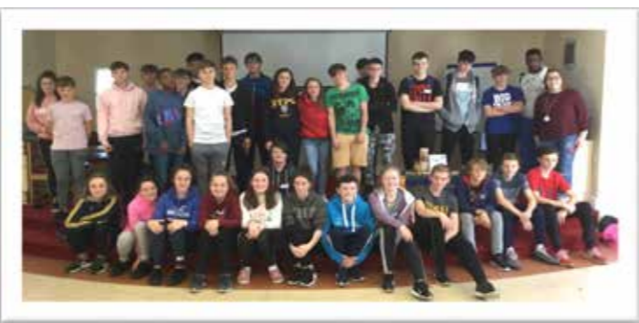
3 rd Year Retreat in SCALA, Blackrock