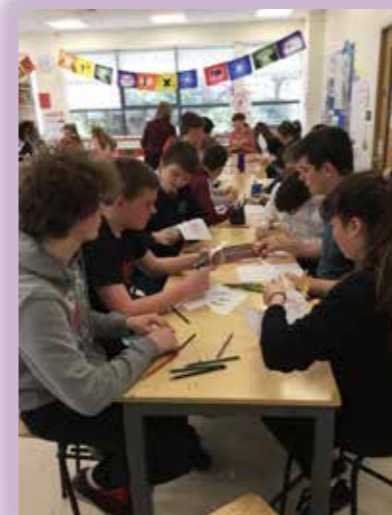
Wellbeing Afternoon Art

On Friday 12th April, all students had a well-deserved break from afternoon classes to participate in an afternoon of Wellbeing. Students were grouped according to the Houses of Ventus, Ignis, Aqua and Terra and the emphasis for this event was on cooperation and the creation of a sense of connectedness to fellow students within and across year groups.