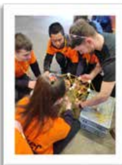
Bridge construction underway

In March, our 2nd Year students visited Stryker to celebrate Engineers Week 2019. The day began with a talk on the biomedical devices produced in the facility.