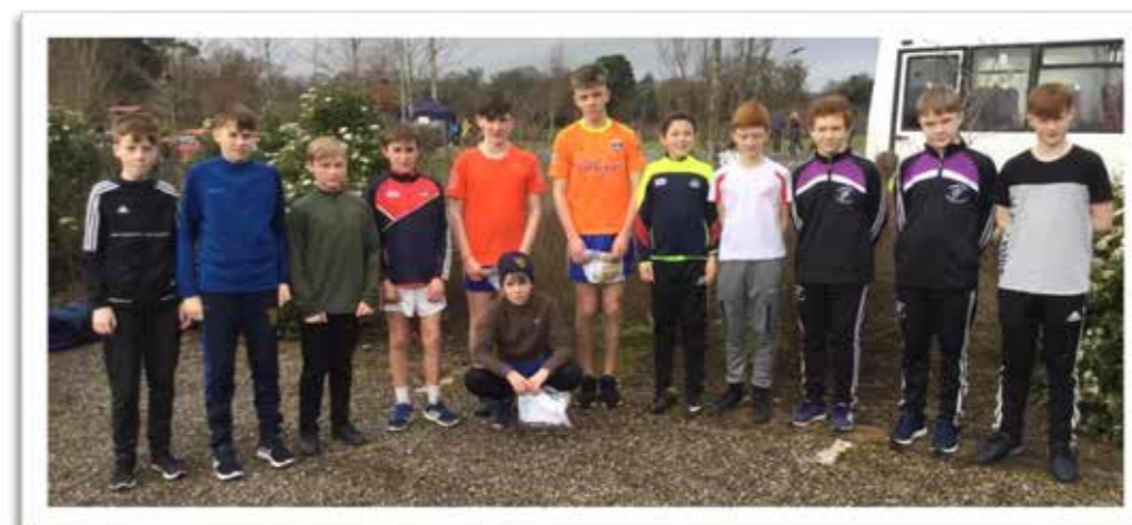
CCC Students at Cork Post-Primary Orienteering Championships in Fota Gardens