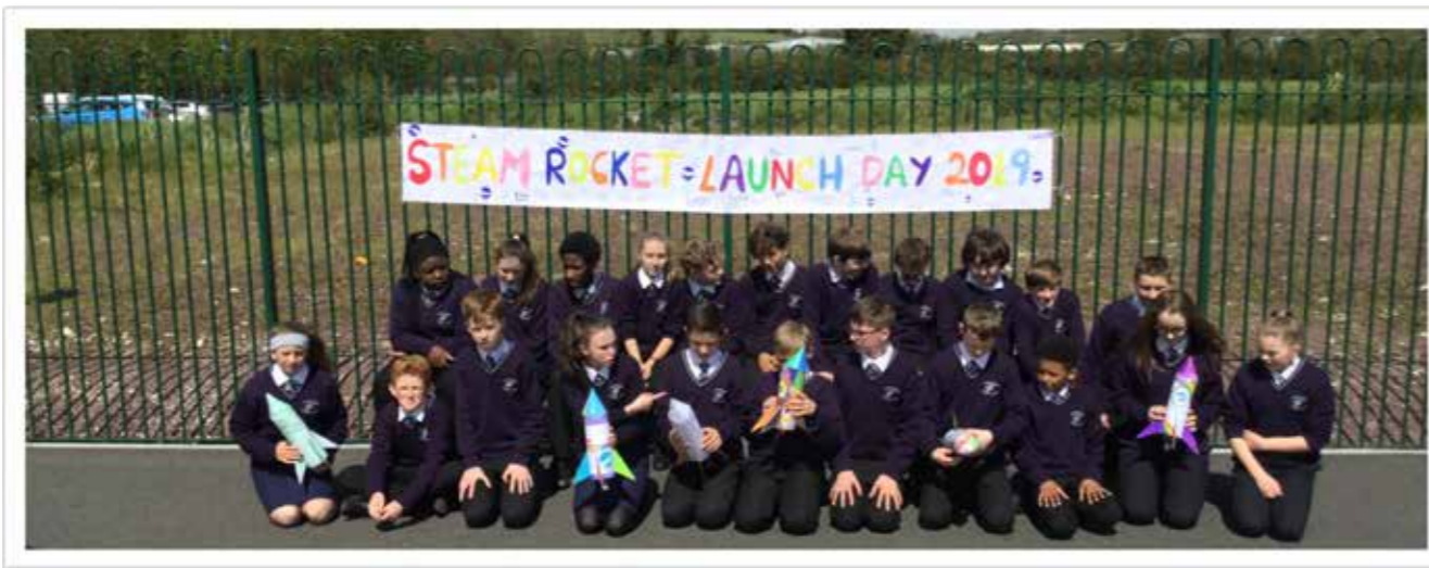
Rocket launch day—S.T.E.A.M.